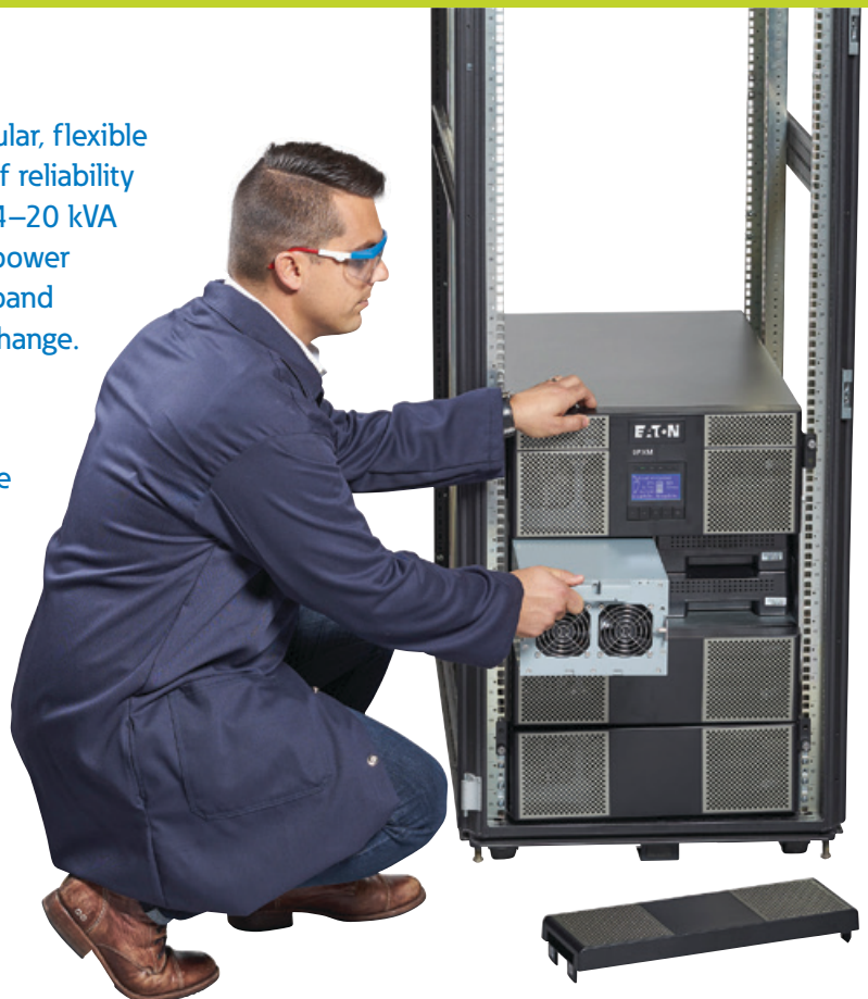
Easy hot-swappable power and battery modules

The plug-and-play power and battery modules are user replaceable so you can add them as needed without a service call or having to put a redundant system in bypass. With its low initial investment, online double-conversion technology, Eaton ABM® technology and high efficiency mode, you never have to compromise reliability for efficiency.