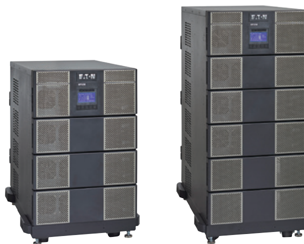
8-slot cabinet is scalable to 16 kVA in a 14U cabinet