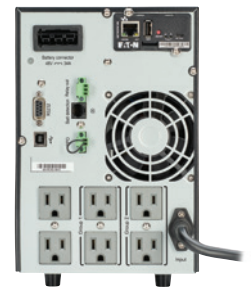
Eaton Network-M2 installed (top right on UPS)

Eaton's full range of network connectivity devices enables you to remotely monitor and manage your power quality equipment. From outlet by outlet energy consumption reports to temperature and humidity readings, connectivity devices give you full control of your IT environment from offsite. This high level of awareness and control allows you to take full advantage of helping ensure business continuity.