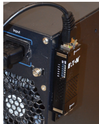
Eaton EMP Gen 2 installed